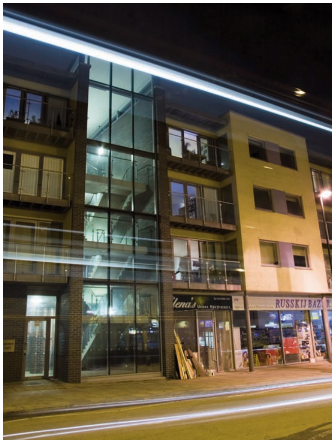
Claremont Court, East London which houses artists from five international residency programmes