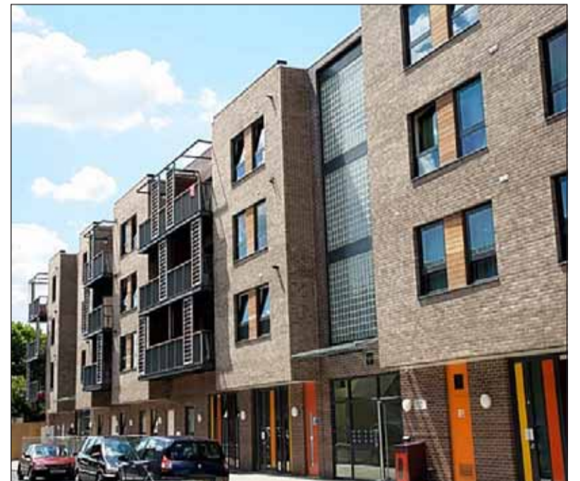
Atelier Court in E14 offers 21 Acme studios, called Leven Road, which are built into the development's ground floor. For more details, call Acme on 020 8981 6811

For more on all schemes, visit www.acme.org.uk , or call 020 8981 6811.