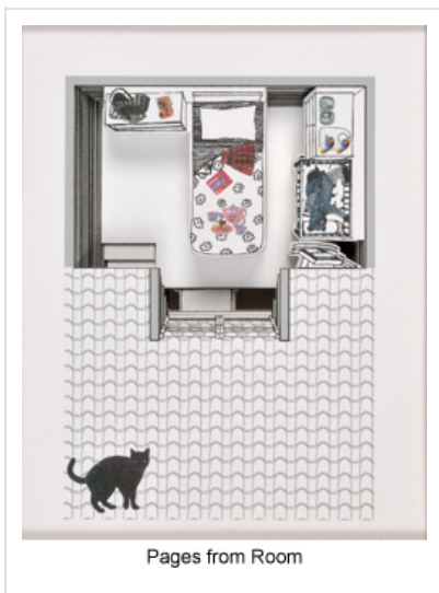
Pages from Room

The ‘someone’ who lives in that space is a girl. The narrative is that of this girl growing up, commencing with her as an infant just home from the hospital to growing up to become 18 years of age, when she will leave for university, leaving the room and her childhood behind her. But the girl herself is not part of the artwork! Instead, the girl and her growing up are symbolized by the objects and the way they are placed in the room.