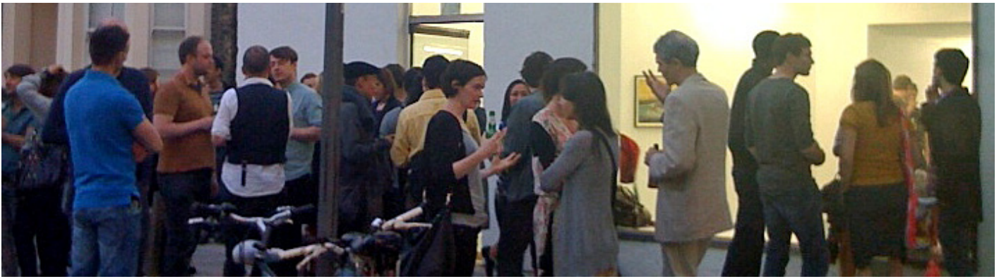
Private view of 'An Elaborate Fiction' at the Acme Project Space, E3. Photo: Acme Studios (2010)

Associate artists spend their time alongside artists on the core IRP programme, and are also encouraged to make links with other artists, organisations and arts professionals in London, as a means of expanding their professional networks.