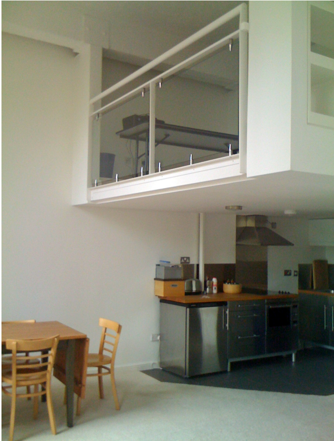
Bow Quarter Estate work/live unit in East London, showing mezzanine bedroom and flexible living space.