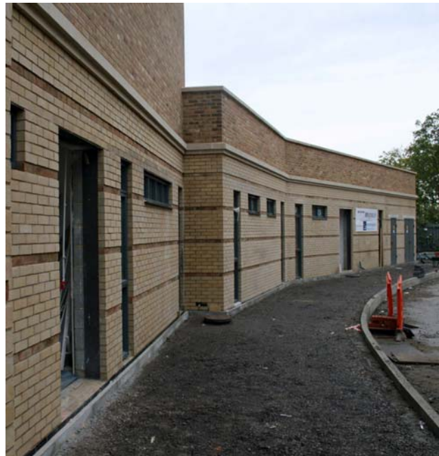
Left: Manor Point development .Right: Exterior of ground floor artists' studios.

The studios are fully wheelchair-accessible. There will be a loading and drop-off point to the side of the studios and space for disabled parking. There is some Pay and Display parking space available in Harrow Road. Nearby side streets adjoining Harrow Road are restricted by permit. All artists will have 24-hour access to the building.