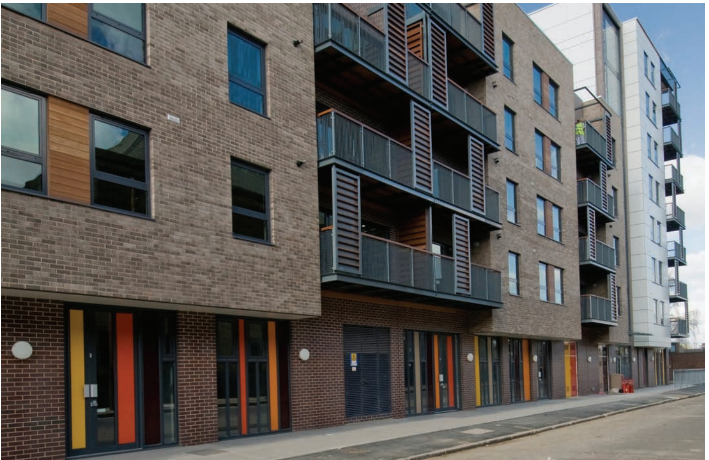
Leven Road showing artists' studios on ground floor.

Tower Hamlets wanted job provision included in the development. However, building business units speculatively is a high risk activity. Units may not be let or sold for some time, threatening project viability. Vacant boarded-up units detract from the area, increase the risk of vandalism and crime and become harder to let.