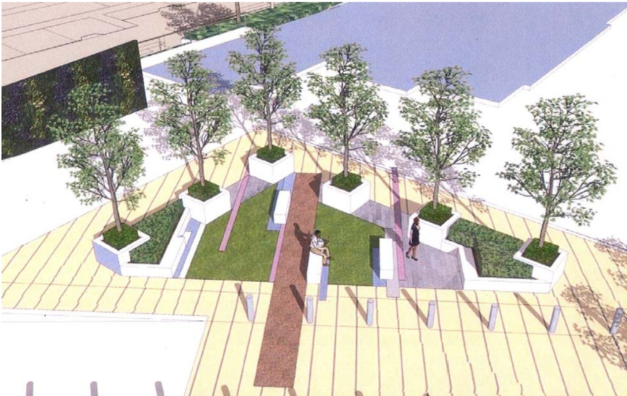
A visualisation of the designated area showing its scale and relationship with the site – the landscaping treatment is for illustrational purposes only