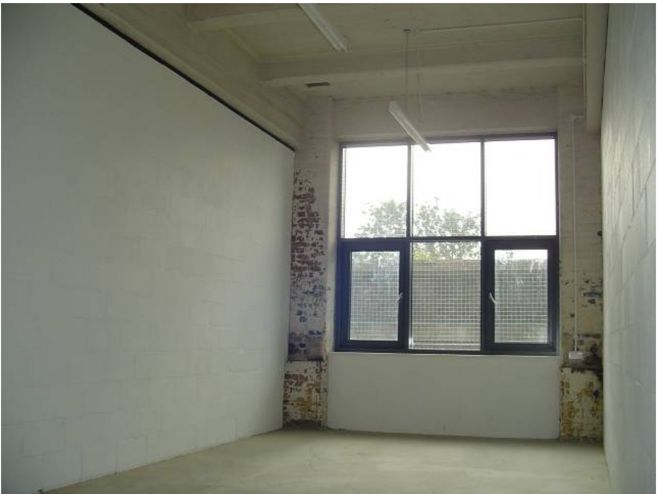
First floor studio nearing completion at Childers Street, SE8. (July 2010)

Acme Studios is currently developing 30 additional self-contained studios on the ground and first floors in a former propeller factory in Deptford, in addition to 100 existing studios in the building. Construction of the studios is almost complete and they will be ready for occupation in October 2010 .