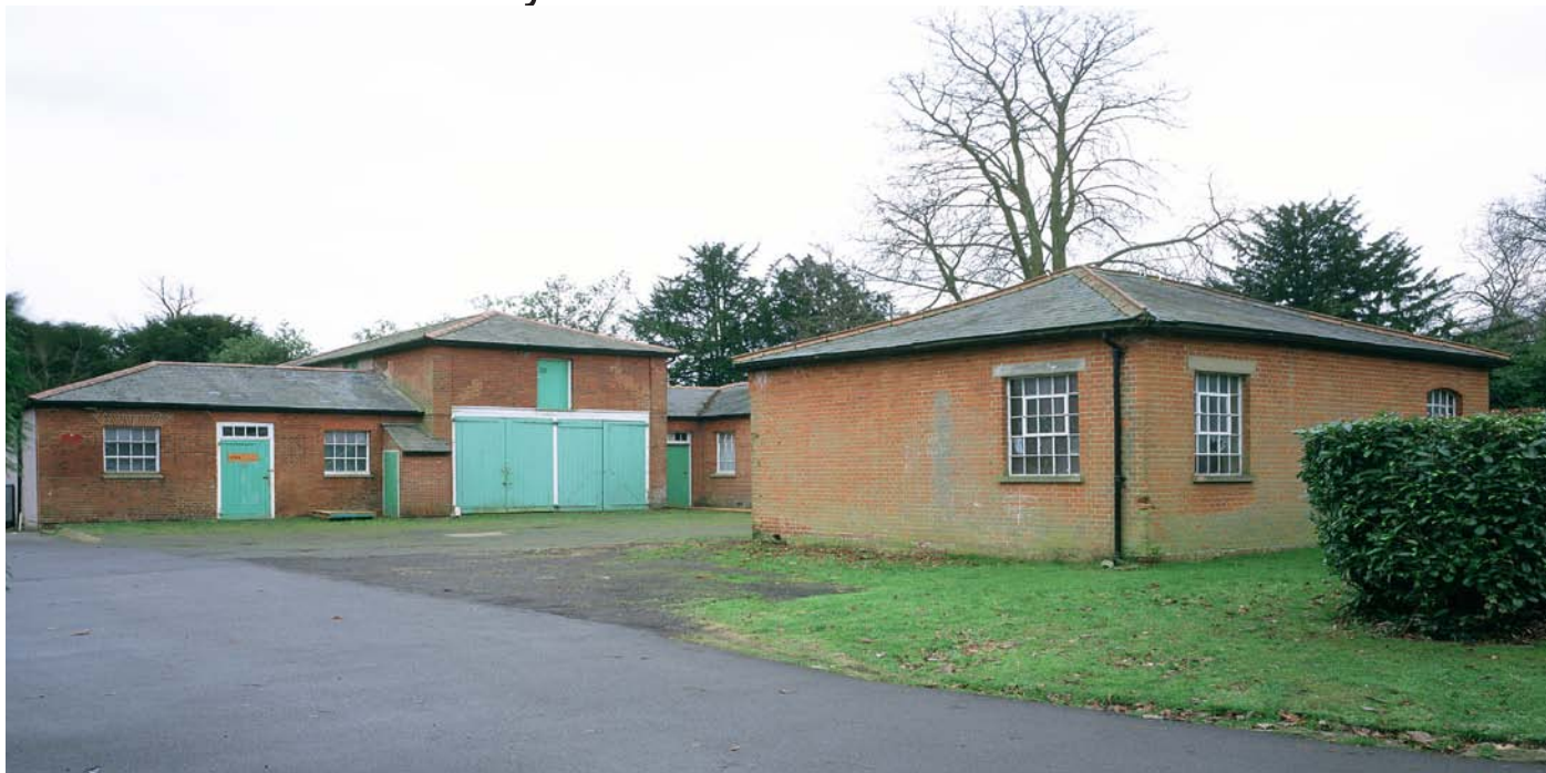
The Old Stable Block, Oaks Park. Photo: Hugo Glendinning (1994/5)