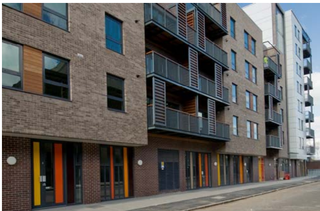
Leven Road showing artists' studios on ground floor.

Leven Road in London, E14, is the first 100 per cent affordable mixed-use development in the UK. The project consists of 66 affordable housing units for rent and shared ownership and 21 affordable artists' studios.