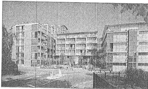
Creative colony: The Galleria is deliberately designed to integrate commercial and residential elements

Already it has quite a lot to shout about: a funky library designed by architect Will Alsop; proximity to Camberwell School of Art and Goldsmiths College; an emerging gallery scene; a proposed theatre and a council-sponsored streetscape programme involving local resident and the sculptor behind Angel of The North,